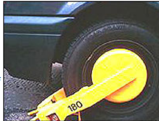
B&NES council says it is difficult to trace foreign vehicles

The car racked up the series of tickets when it continued to park without a permit in Bath's Norfolk Buildings.